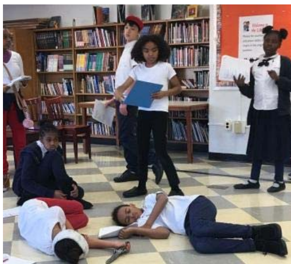
Practicing sad scene!